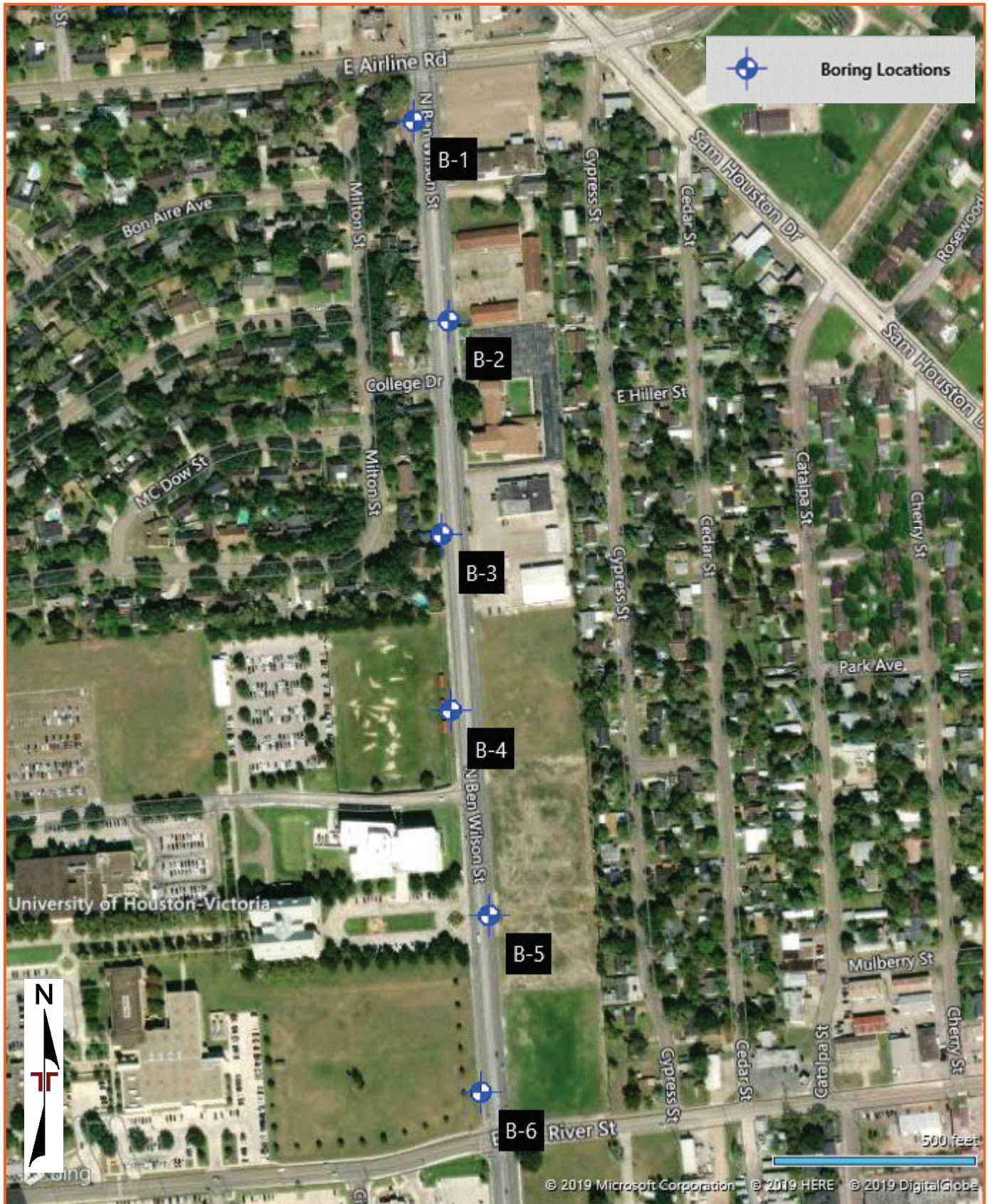
DIAGRAM IS FOR GENERAL LOCATION ONLY, AND IS NOT INTENDED FOR CONSTRUCTION PURPOSES

Ben Wilson Street Pavement Improvements ■ Victoria, Texas May 8, 2020 ■ Terracon Project No. 92195605.Revision1